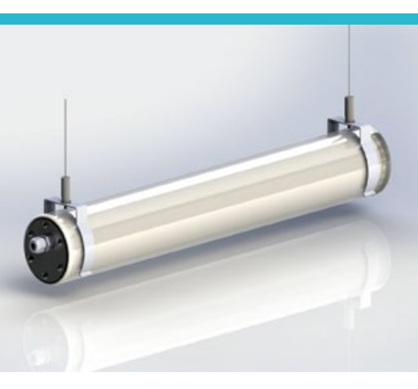
DL-SEAL suspended on adjustable cables