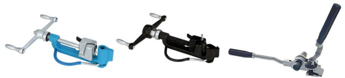
ABB Ty-Met Cable Ties