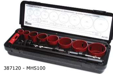
387120 - MHS100