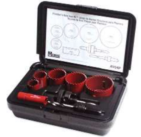
387122 - MHS04P