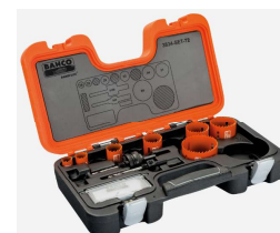
260364 SET 72