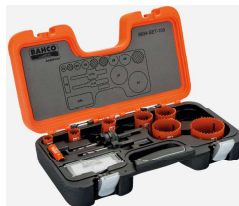
260363 SET 103