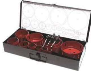
387124 - MHS06L