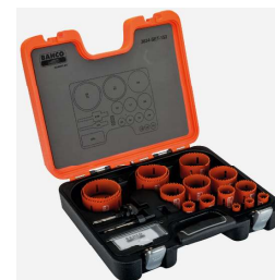
260362 SET 152