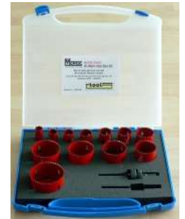
387127 - MHS08IE