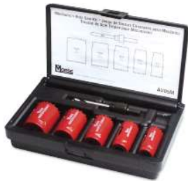
387123 - MHS05M