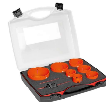
260365 SET 72-35/83