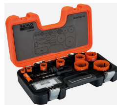
260361 SET 95