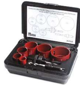
387121 - MHS02E