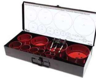
387125 - MHS08E