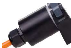
IP68 Protection - 50m / 5h.