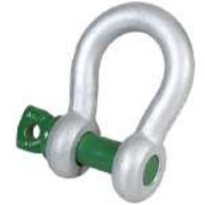
SC Type Bow Shackle