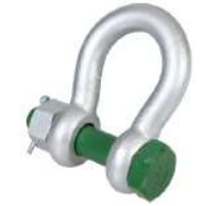
BN Type Bow Shackle