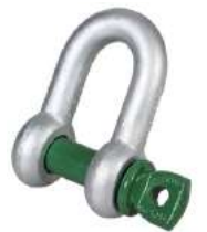
SC Type Dee Shackle