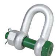
BN Type Dee Shackle