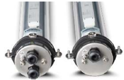
At the end of the luminaire there is a choice in one or two cable glands for easier cable management.

All texts with this symbol [*] represents preliminary values and data. Those can be changed, but not significantly. For updated datasheet or more information please contact us.