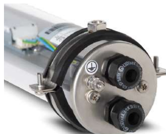
Both ends of the luminaires are prepared to connection of external grounding.