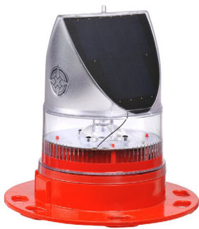
Picture left is the SL-70 Solar Lantern 2-3NM

These lanterns are equipped with the latest Monocrystalline Solar Panels that are 20% more efficient compared to other solar panels.