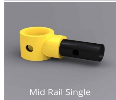
Mid Rail Single