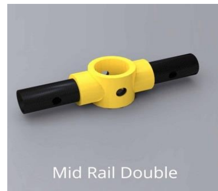
Mid Rail Double