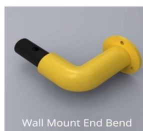
Wall Mount End Bend