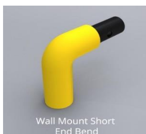
Wall Mount Short End Bend