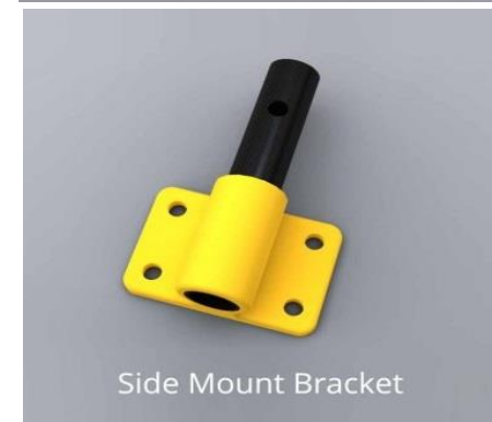
Side Mount Bracket