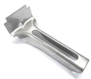
J - Clip Birds Mouth