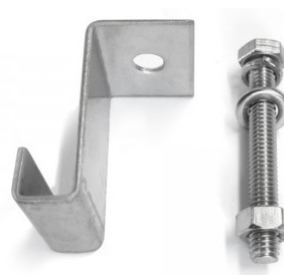
L - Clip