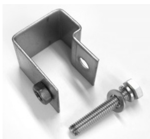
C - Clip

The J Clips can be used in combination with the M clips for support from underneath.