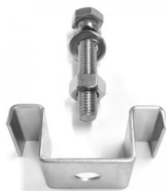
M - Clip