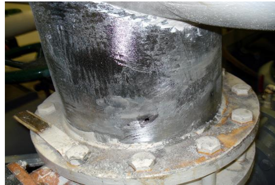
Tercoo® result on an old steel pipe to clean the surface and make a good roughness for a repair job. Job done with the Tercoo® Single disc and Trio disc on a hand drilling machine.