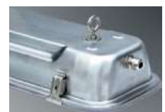
Vyrtych SALUKA with optional Stainless Steel Housing