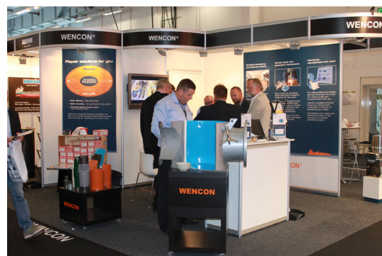
WENCON at SMM2014, Hamburg

We welcome EQUIMER and look forward to a future cooperation with them.