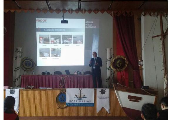
For information on this type of seminar, please contact our sales dept.

The purpose of the seminar, was to introduce the participants to Wencon repair solutions and general use of Wencon products.