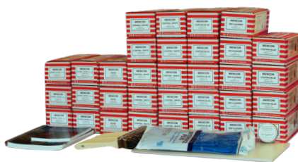
WENCON Docking Kit Standard

The Docking Kit provides up to 10m 2 or 20m 2 of corrosion and wear protections coverage, to be applied where you need it.