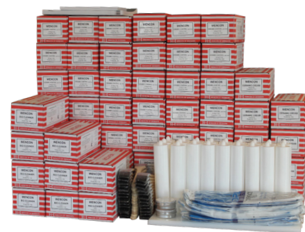
WENCON Docking Kit Extended

The Docking Kit can be customized to your needs, if additional products are required.