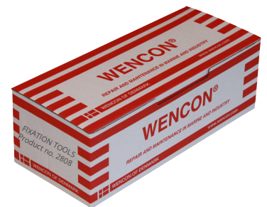
WENCON Fixation Tools Product No. 2808