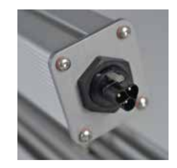
The IP68 rating connector ensures a simple connection. At the request of the customer, it can be replaced with a custom solution.

Telefon +420 222 312 917 info@doublepower.cz www.doublepower.cz