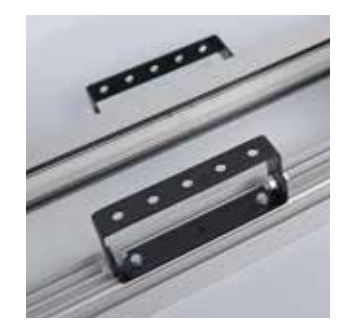
An adaptive holder for various fixation spans based on the client's specifications is included.