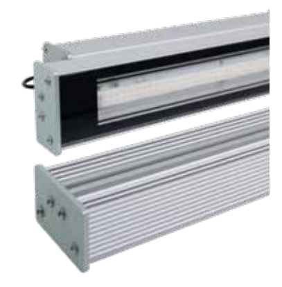
A specially designed aluminium body ensures efficient heat conduction during the warm summer months. On the contrary, a unique front-screen heating system is automatically activated if the luminaire is covered by ice, frost or snow.