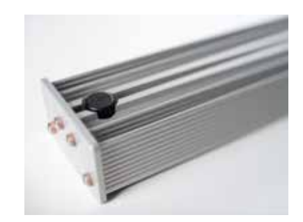
A valve in the luminaire body helps balance the pressure during the controlled heating of the luminaire in the winter.