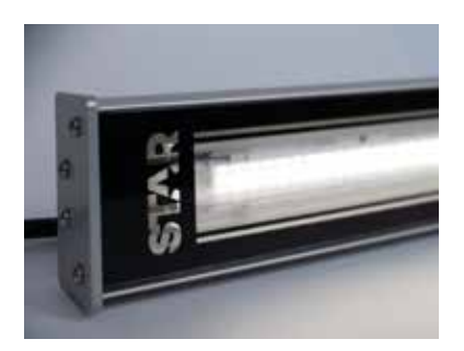
The luminaire has high quality LED chips from Samsung with chromatic temperatures of 2700K through 6500K.