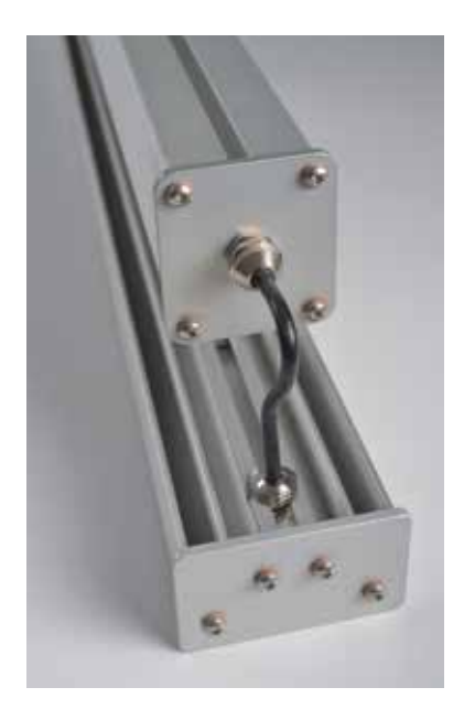
Separating the ballast from the luminaire body guarantees that the ballast and LED chips do not mutually affect one another and function in maximum temperature comfort. This had a positive affect on the service life of the luminaire